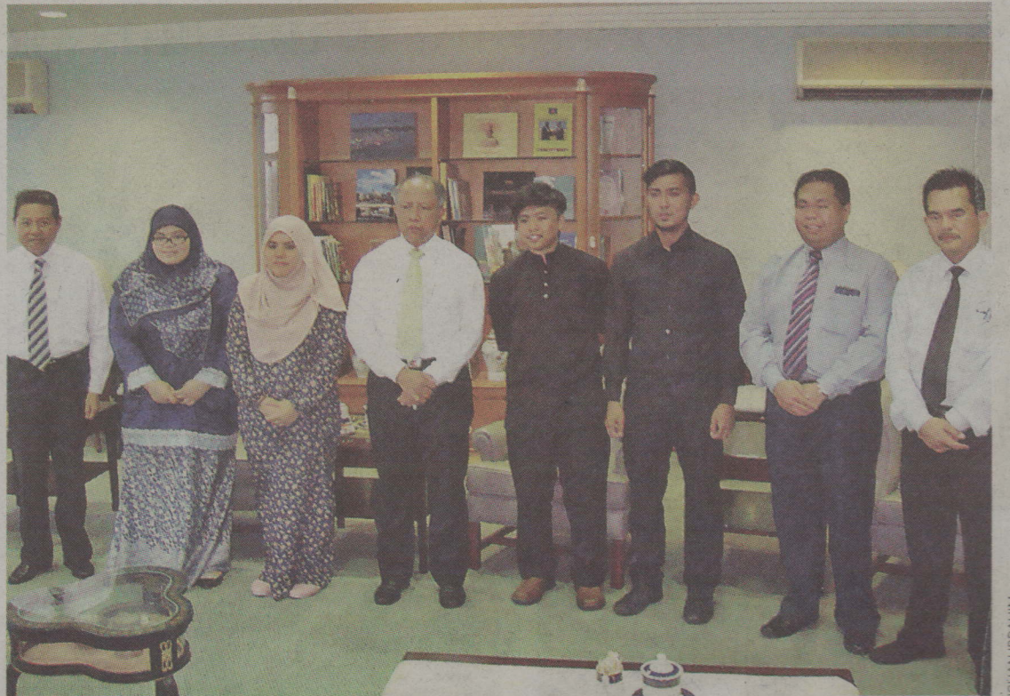
Minister of Culture, Youth and Sports, Pehin Datu Lailaraja Major General (Rtd) Dato Paduka Seri Haji Awang Halbi bin Haji Mohd Yussof, with the Best Trainee Award recipients

PPB was set up in May 1996 to offer various training programmes for underprivileged youths, as well as to provide them with valuable life skills.