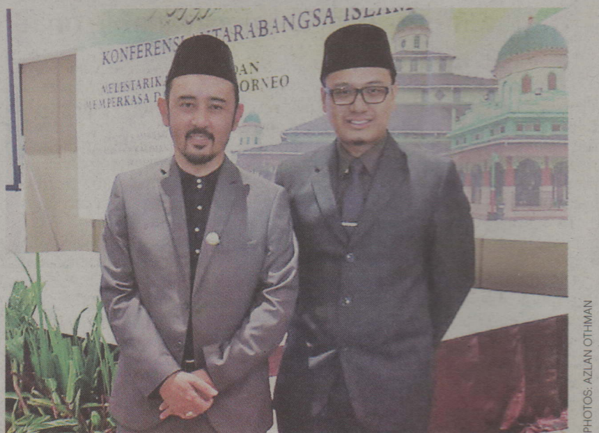
Presenters from the Religious Teachers University College of Seri Begawan