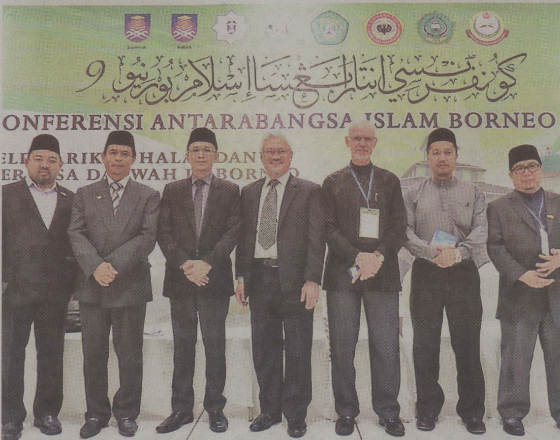
Paper presenters from the Universiti Islam Sultan Sharif Ali and Universiti Teknologi Mara Sarawak at the recent 9 th International Islamic Borneo Conference held in Banjarmasin, Indonesia