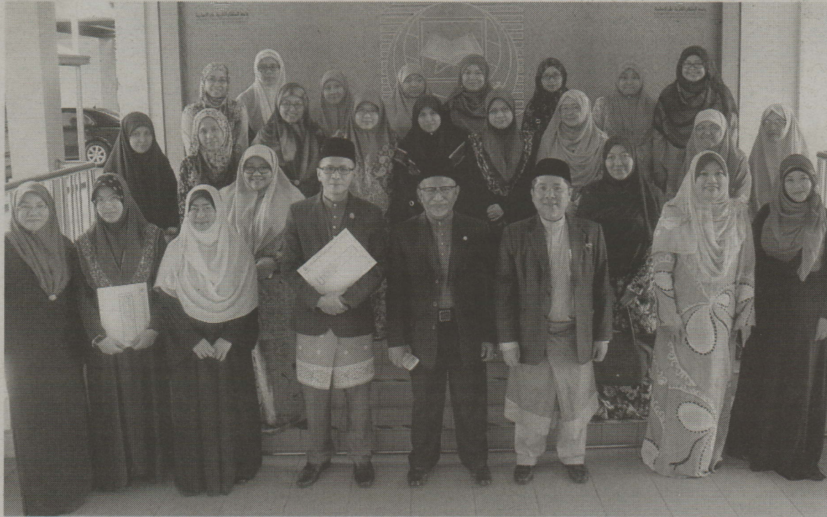
Some of Universiti Islam Sultan Sharif Ali's (UNISSA) academic staff who participated in a three-day workshop on improving teaching methodology.