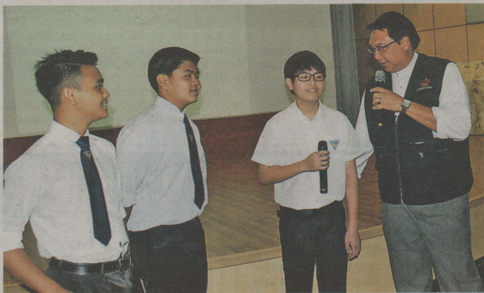
Students answer questions during the quiz

This year, the Information Department has conducted similar talks at 10 different schools in the Brunei-Muara District including CHMS yesterday.