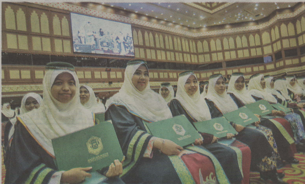
Graduates during the convocation with their certificates