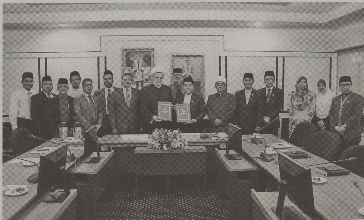
A group photo taken at the signing ceremony