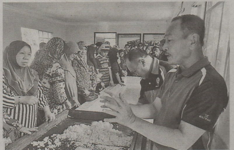
Kampong Jerudong village residents listen to an explanation on sago-making

THE Kampong Jerudong Village Consultative Council members and some of its village residents observed a sago-making (Ambulong) demonstration during their visit to Kampong Batu Apoi in the Temburong District over the weekend.