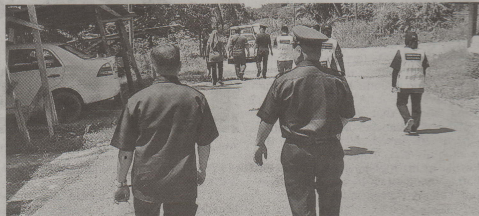
A crime prevention patrol being carried out

The RBPF called upon the public to report any suspicious activity by calling the 993 hotline or report directly to the nearest police station towards together maintaining peace and security.