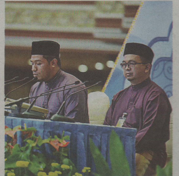
Reciting Al-Quran verses during the Israk Mikraj celebration