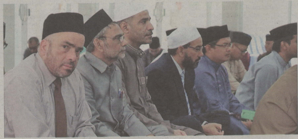
Some of the UNISSA staff during the ceremony