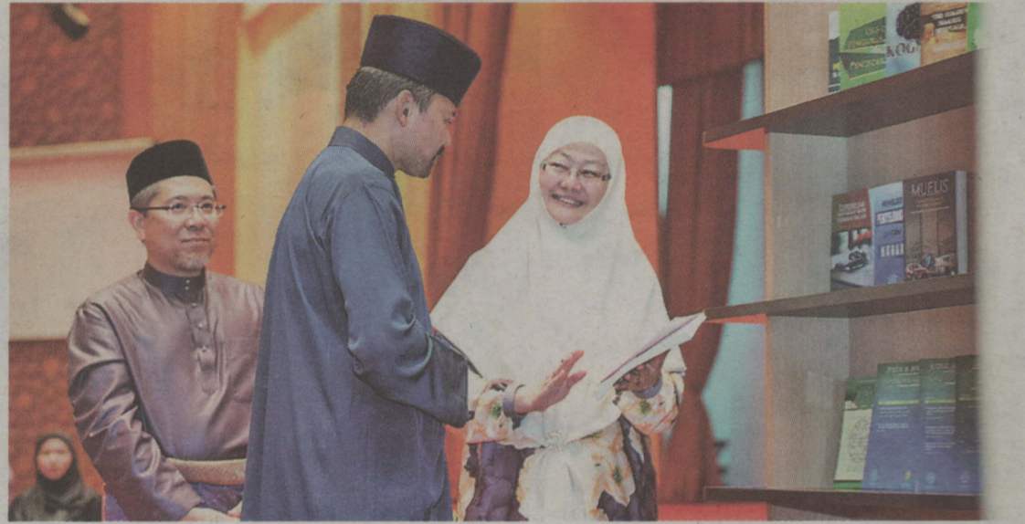
His Royal Highness taking a closer look at the latest publications of UNISSA