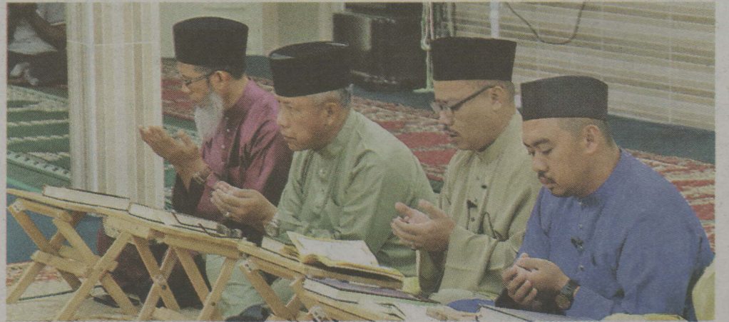
Minister of Defence II Pehin Datu Lailaraja Major General (Rtd) Dato Paduka Seri Haji Awang Halbi bin Haji Mohd Yussof in his capacity as the Patron of Kampong Kilanas Mosque at the event