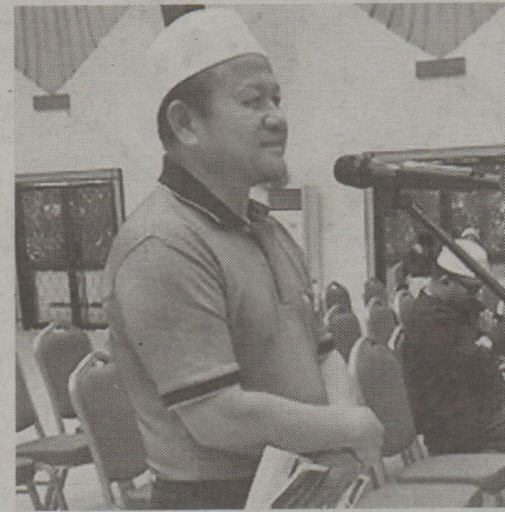
ABOVE: Two of the participants during the question-and-answer session.