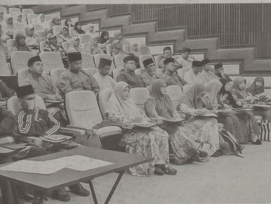
Attendees at the workshop