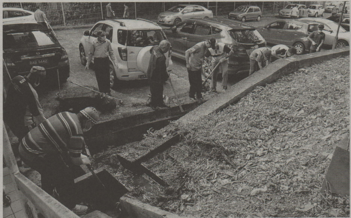
UNISSA students, lecturers and staff take part in a cleaning campaign aimed at maintaining environmental cleanliness to counter mosquito-borne diseases such as Zika and dengue.

most important role in vector management to minimise the mosquito population around our localities."