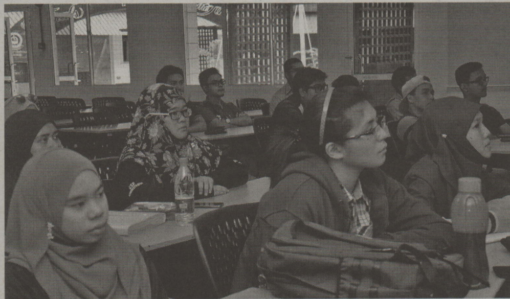
Universiti Teknologi Brunei (UTB) organised a talk to raise awareness on the Zika virus and educate staff and students on ways to prevent it.