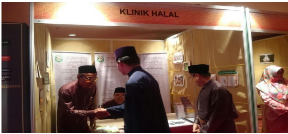
Halal Clinic during 7th Mabrujan Hafl al-Takbarruj at ICC

lis Sambutan Mawlid Nabi 1439H at Shafie Mosque, UNISSA on 14th December 2017 as shown picture below.