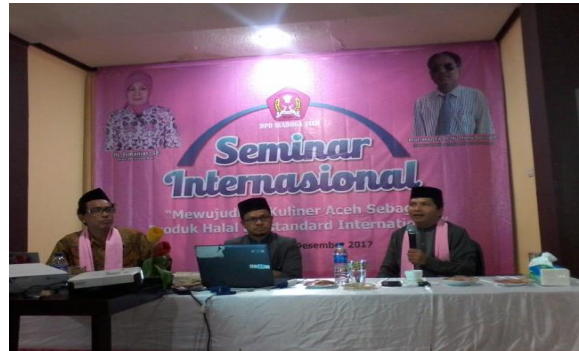
Presented paper at Aceh on 25th December 2017

On 25th December, Director of HTRC had been presented paper at Aceh titled 'Ke arah Memperkasakan Produk Halal Aceh ke Peringkat Antarabangsa' during Seminar Internasional with theme 'Mewujudkan Kuliner Aceh Sebagai Produk Halal Berstandard Internasional'. At the same day, after Maghrib, Director also gave short tazkirah titled 'Produk Halal Rahmatun Lil Alamin' at Masjid Raya Baitul Ar-Rahman.