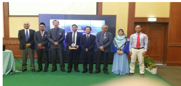
Photo session during SAPPHAT 2017

In addition, Director also presented paper titled ' Memperkasakan Produk Halalan Thayyiban Teras