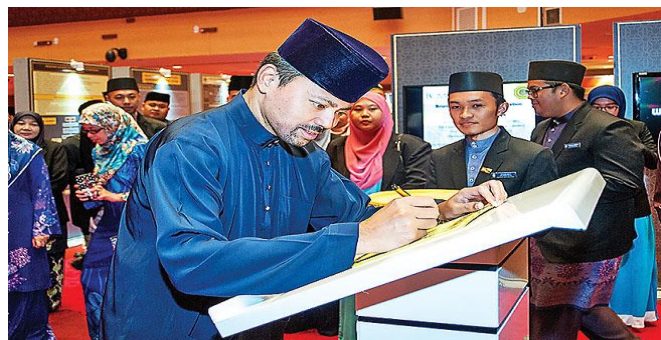
His Royal Highness signing a memorabilia of Halalan Thayyiban Research Centre during 7th Mahrajan Hafl al-Takharruj at International Convention Centre, Berakas

Halalan Thayyiban Research Centre also had been inaugurated on the 7th Mahrajan Hafl al-Takharruj at International Convention Centre, Berakas, Brunei Darussalam by His Royal Highness Crown Prince (Dr) Haji Al-Muhtadee Billah Ibn Hus Majesty Haji Hassanal Bolkiah and the Sultan od Brunei Darussalam, Senior Minister at Prime Minister Office and Pro-Chancellor of UNISSA, was elected to sign the Halalan Thayyiban Research Centre memorabilia.