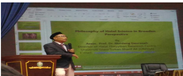
Present during Halal Science Interaction Programme