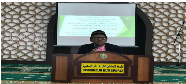
Director of HTRC during his short tazkeirah in conjunction Majlis