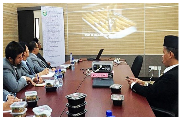
During the presentation

Representatives from both universities also discuss the possibility of working together in various fields relating to the Halal industry, including cooperation in holding of conference as well as the conducting of research in the Halal field.