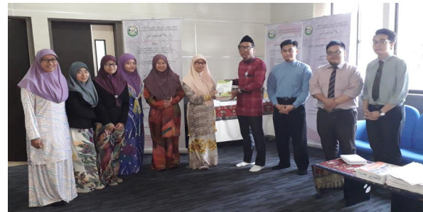
Visit from Halal Food Control Division