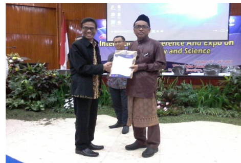
Presentation of gifts to Director of HTRC during ICEHIS 2017.

During the ICEHIS 2017, Director of HTRC had presented paper titled 'UNISSA Post-graduate Studies in Halal Science towards Global Education and Research' which highlight the experience of UNISSA's Halalan Thayyiban Research Centre in disseminating halal science through education and research for global reach.