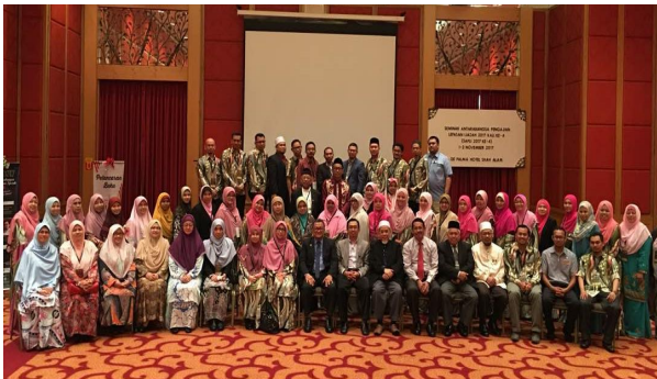
Photo session during SAPLI 2017