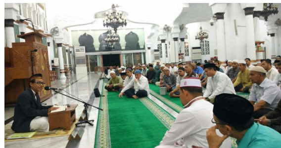
Kuliah Maghrib at Masjid Raya Baitul Ar-Rahman