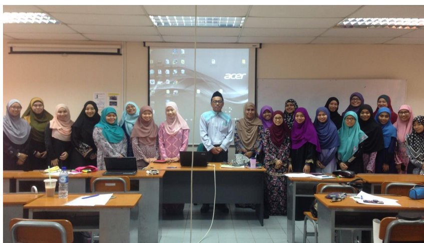
Sesi bergambar ramai

Pusat Penyelidikan Halalan Thayyiban (PPHT), Universiti Islam Sultan Sharif Ali (UNISSA) pada 23hb Oktober 2017 telah membuka Sesi Perkongsian Ilmu kepada warga UNISSA secara percuma.