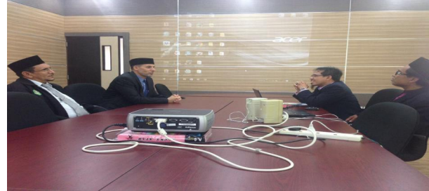
Discussion between Dean PGS of Fatoni University and UNISSA