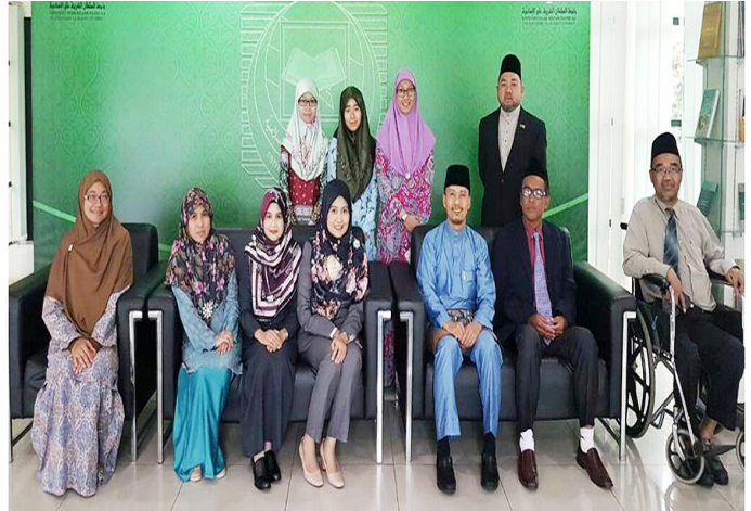
Sesi bergambar ramai

Hasil daripada perbincangan, UNISSA dan UPM bersetuju meneruskan MoU dalam